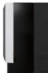
DESIGNER SERIES Depth 195mm