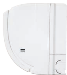
TRADITIONAL HEAT PUMP Depth 257mm